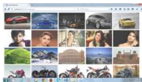
Fig-2: Image Authentication Window

First step is included in first level of security From which we can identifies that authorize user access the mail or not. System authenticate only access of authorize user. It is basic step of entering in to the system.