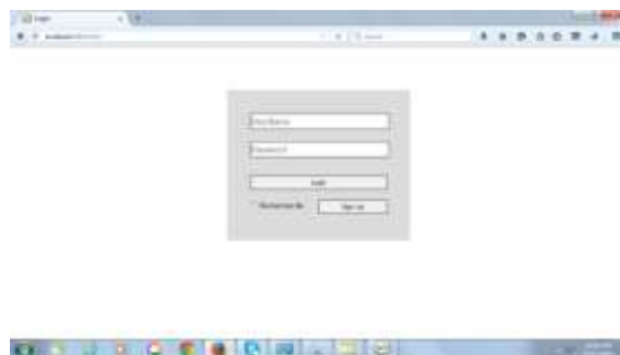
Fig-1: Login Window

comprehension of recreation and its determinations in subtle element.