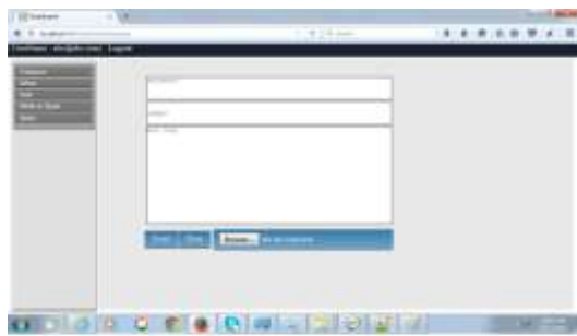
Fig-3: Composition Window

an order of image from multiple categories & register this sequence as identification along with its regular user id & password. When user tries to logging again he must have to select the same sequence from the shown category. This sequence is matched from database through pattern recognition. Image authentication techniques have recently gained great attention due to its importance for a large number of multimedia applications. Digital images are increasingly transmitted over non-secure channels such as the Internet